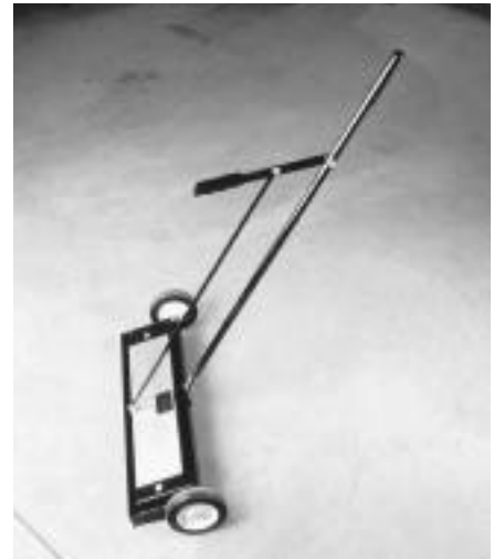
Some assembly required