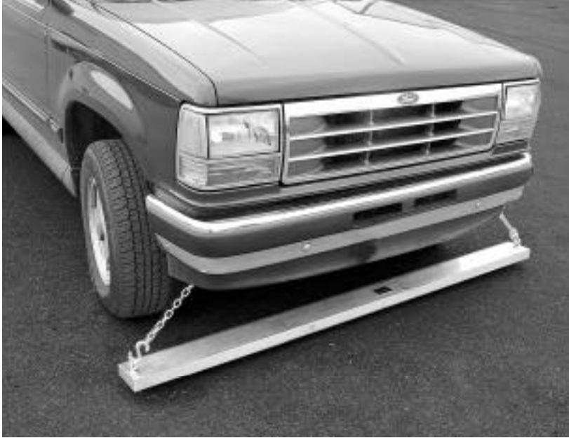
MRS78 pictured. Chains and hooks not included.